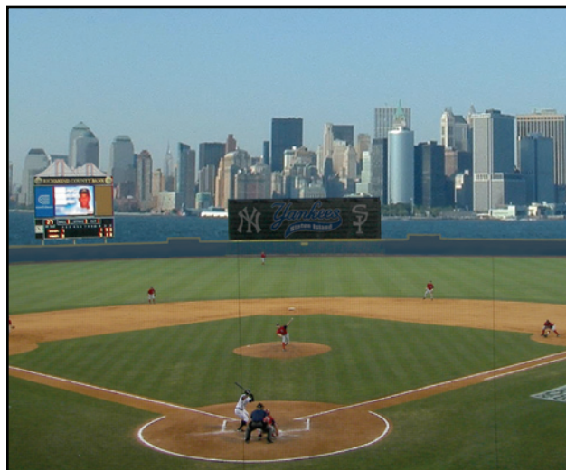
With the amazing views of the Manhattan skyline, we're sure that you'll love your time spent with your loved ones at a Staten Island Yankees game.