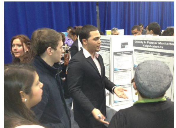
Click to see entire poster

Introduction: this is a quick overview of your poster—includes relevant background info as a context or understanding central theme