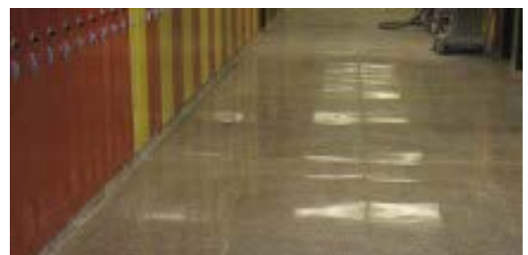
Concrete floor finish proposed by SBLM architects for Art & Music sculpture studio