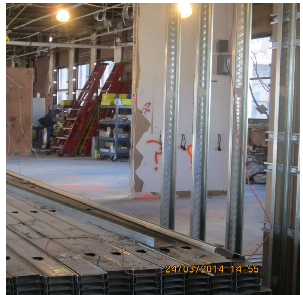
5th floor framing