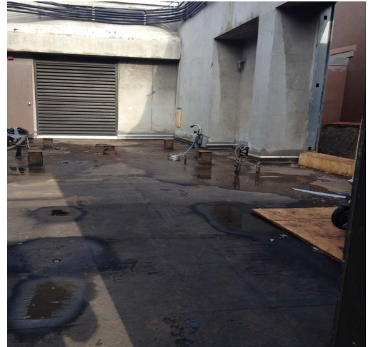
At roof- North cooling tower demolished.