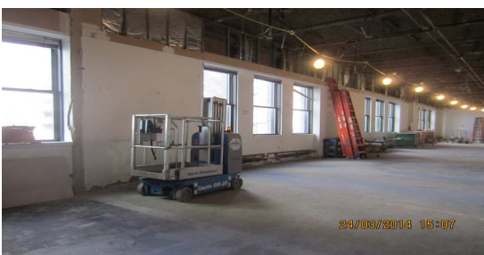
3rd floor north side