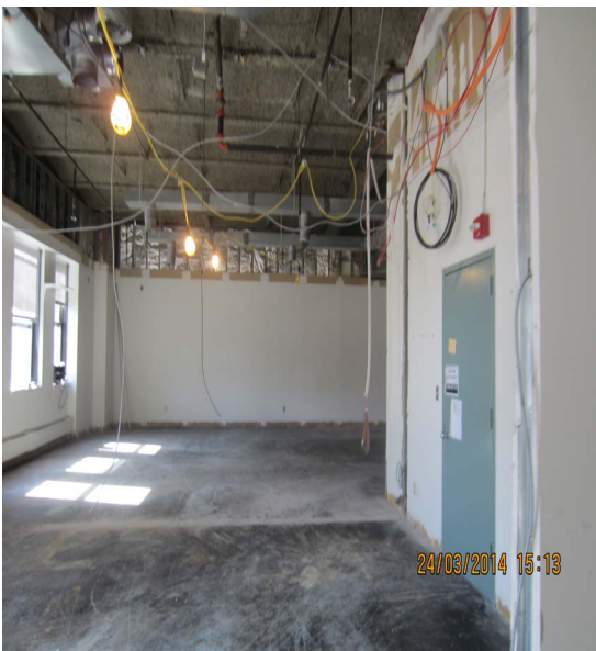
3rd floor-south side