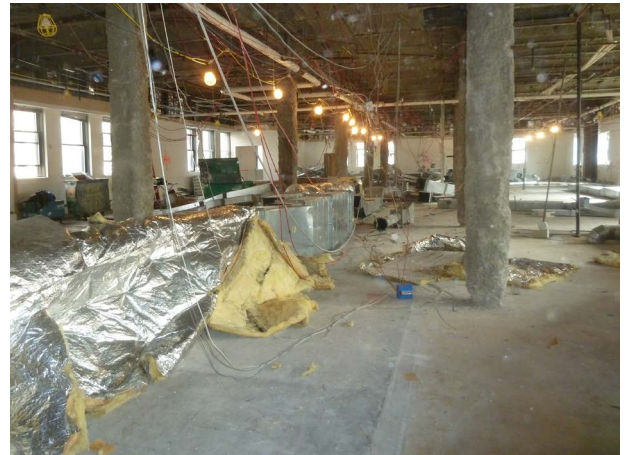
5th floor south side Haaren Hall taken 2/12/2014

3rd floor: Plumbing disconnects- art room