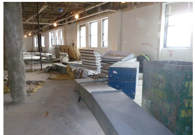
5th floor south side Haaren Hall taken 2/12/2014