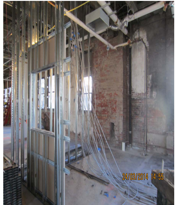
5th floor electrical rough in and framing

Cellar: Preparing for 10" pipe routing over spring break