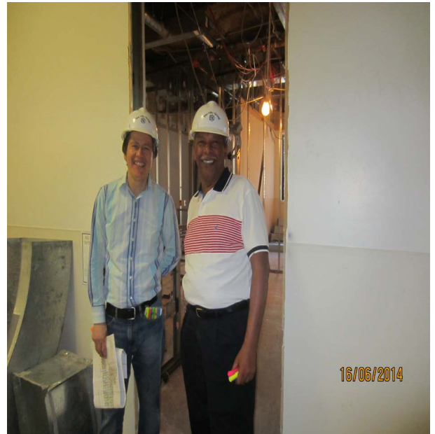
LiRO Construction Management on 5th Floor

Demolish EIFS wall. Cut roof opening and cover.