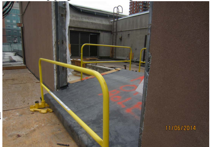
Roof penetration where new MAU will be housed.