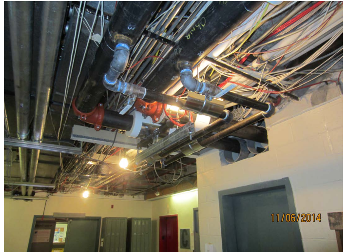
Cellar level piping installed through stock room