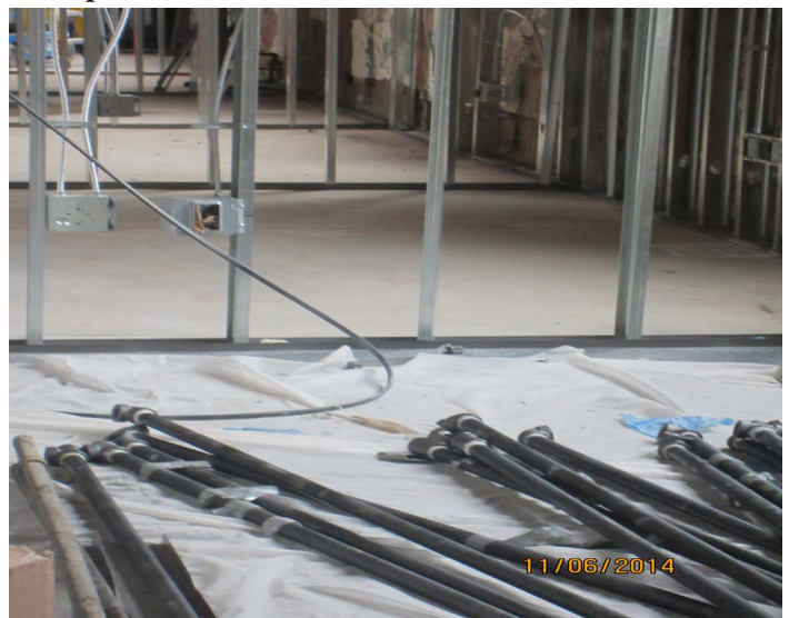
New sprinkler lines- 5th floor.